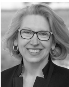
Terri Lynn Land