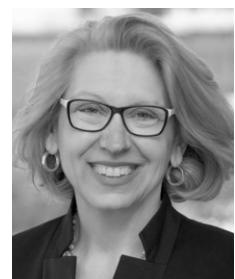
Terri Lynn Land