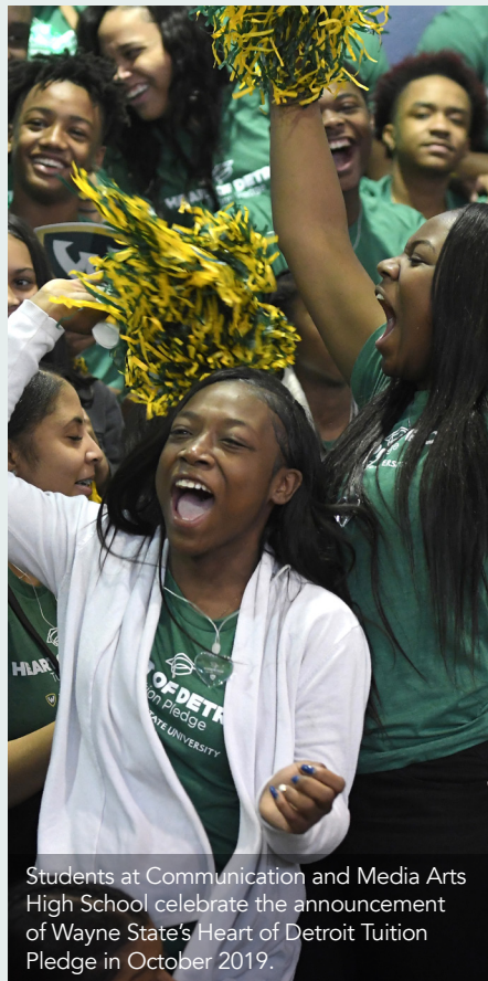
Students at Communication and Media Arts High School celebrate the announcement of Wayne State's Heart of Detroit Tuition Pledge in October 2019.

Wayne State has long sought to make a university education accessible for all students, with initiatives such as the Wayne ACCESS Program, Heart of Detroit Tuition Pledge and the Warrior Way Back debt-forgiveness program, along with myriad merit- and need-based scholarships and aid awards.