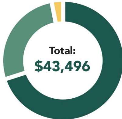
Out-of-state: Living on campus